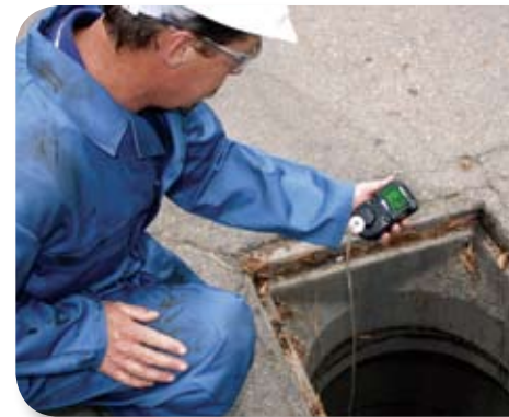
QRAE II Pump being used for a confined space entry

Both diffusion and pump models are compatible with the AutoRAE Lite, Automated Test and Calibration Station.