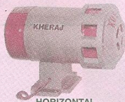
HORIZONTAL SINGLE MOUNTING SIREN