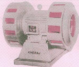
HORIZONTAL DOUBLE MOUNTING SIREN