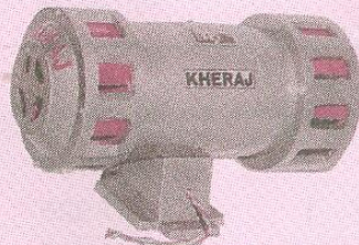
HORIZONTAL DOUBLE MOUNTING SIREN