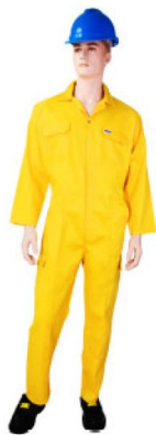
CHIEF - Yellow A1050509