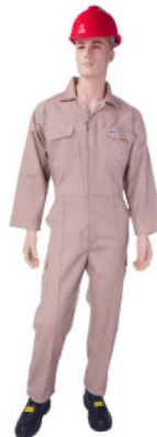
CHIEF - Khaki A1050505