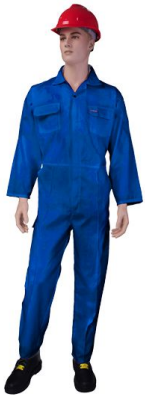
CHIEF - Royal Blue A1050521