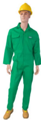
CHIEF - Green A1050510