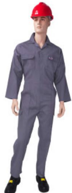
CHIEF - Grey A1050507