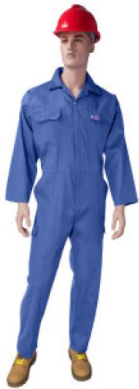
CHIEF - Petrol Blue A1050503