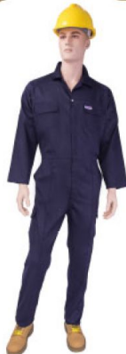
CHIEF - Navy Blue A1050504