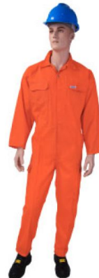
CHIEF - Orange A1050506