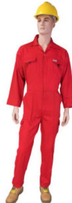
CHIEF - Red A1050512