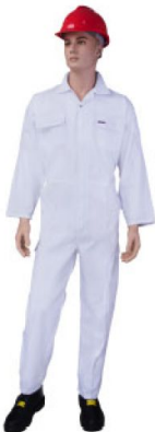
CHIEF - White A1050508